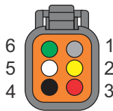
DTM6 connector Wire side view